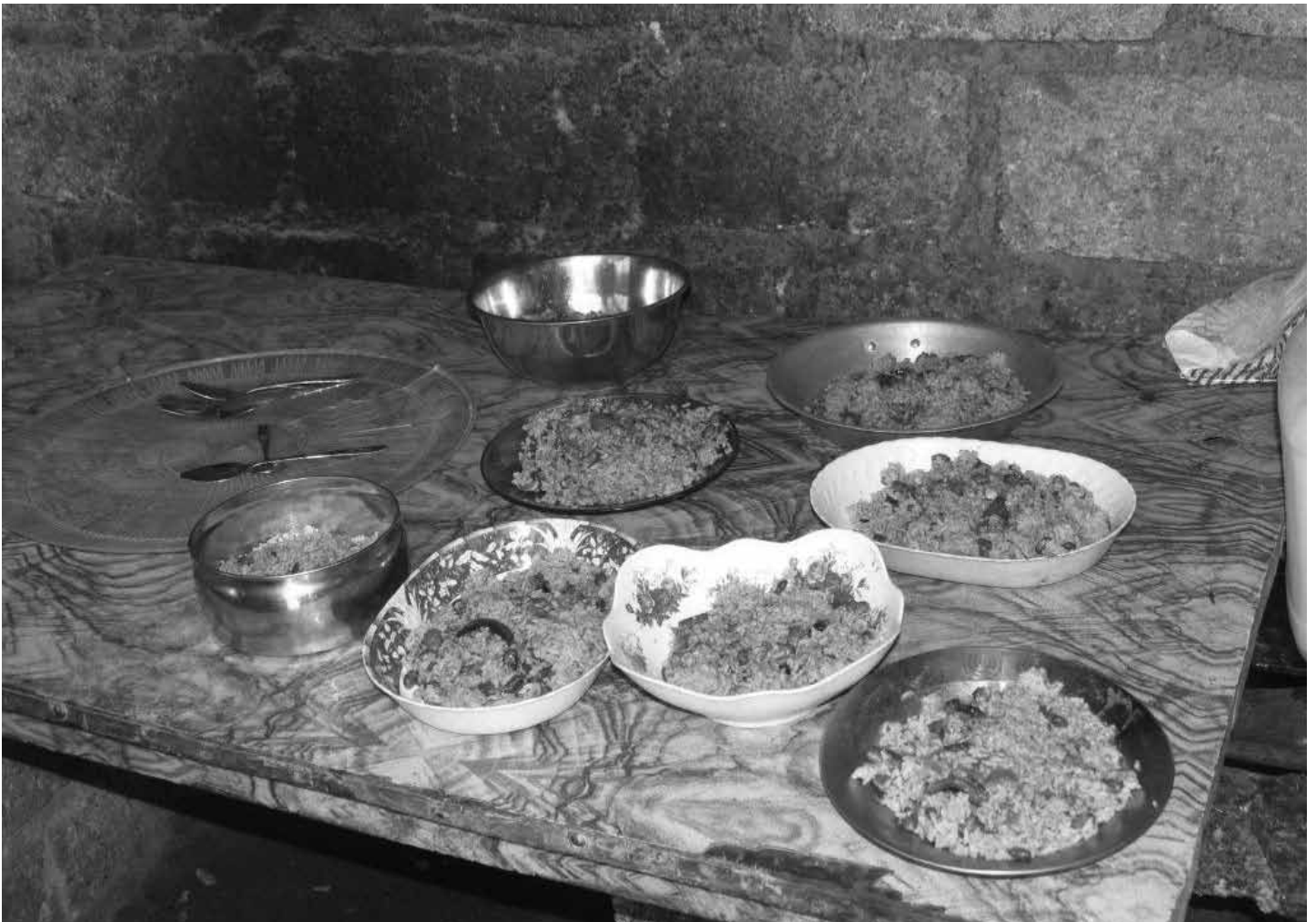
Shown are plates of food ready for the students

Many of you know that Erna McBride, a long time member of our board, set up a trust fund after the passing of her daughter, to sponsor a complete school within the feeding program. Mixte Nazareth had a population of 150 kids when they started the feeding program. That number swelled to such an extent that they now have 397 on the roll as of Dec. While they normally see an increase this one was dramatic. Trinity / Hope does such a wonderful job in running this program. They do it for merely 26 cents per meal and from the picture one can see that the portions are not small. They feed daily 17,750 kids in 91 different schools, but have 30 schools waiting in the wings. 60 - 65% of the Haitian population practices Voodoo, but when they attend one of these schools 955 of the kids become Christian and over half of the parents after the kids take the "Good News" home. As Keith Logan states "one thing is certain...these children we are feeding today are growing into the little missionaries God intended them to be and are impacting God's Kingdom throughout Haiti."